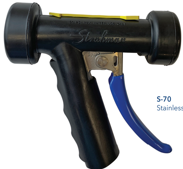
S-70 Stainless Steel