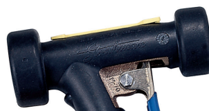
RUBBER COVER - BLACK