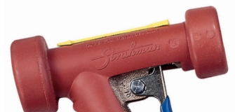
RUBBER COVER - RED