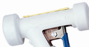
RUBBER COVER - WHITE